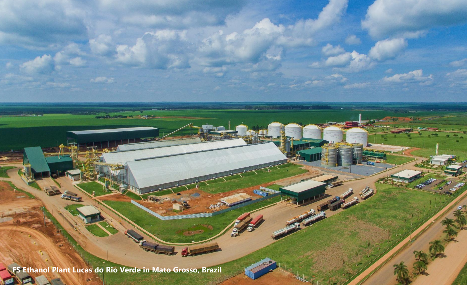
FS Ethanol Plant Lucas do Rio Verde in Mato Grosso, Brazil